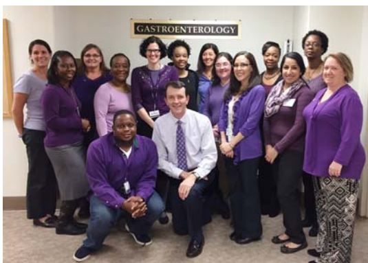
Duke South team celebrates Pancreatic Awareness Month all dressed in purple.