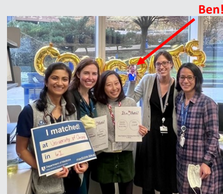
Fellowship Match Day!