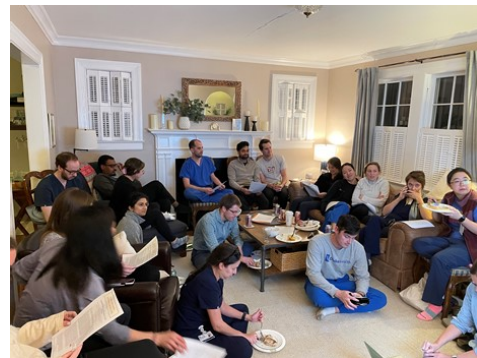
Journal Club led by MP3's