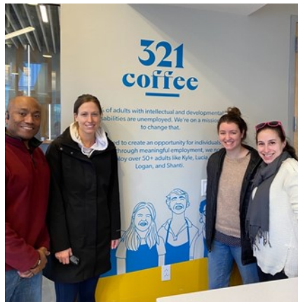
Equity & Inclusion session on anti-ableism and a visit to 321 Coffee in Durham, NC. 321 Coffee intentionally employs people with disabilities.