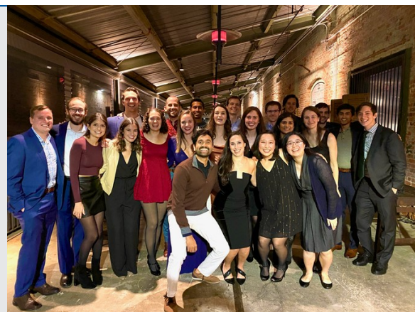
Holiday Party 2022!

I am very excited about working more closely with the Med-Peds residents and being more formally involved in the Med-Peds community at Duke. What I love most about being an educator is watching trainees grow and continue to become better physicians over time. I'm humbled by being able to play a small role in that growth, whether through mentoring and advising or direct patient care on the wards. I'm looking forward to being a formal mentor to the Med-Peds residents as an APD. I am also passionate about quality improvement and implementation work and am thrilled to mentor residents in their projects to improve patient care. As a former Duke Med-Peds resident, I was grateful to be part of such an incredible program that set me up for success in my career. I look for-