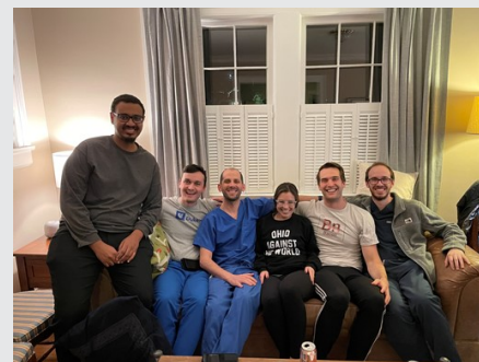
All 6 interns at Journal Club!